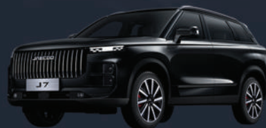
Carbon Crystal Black